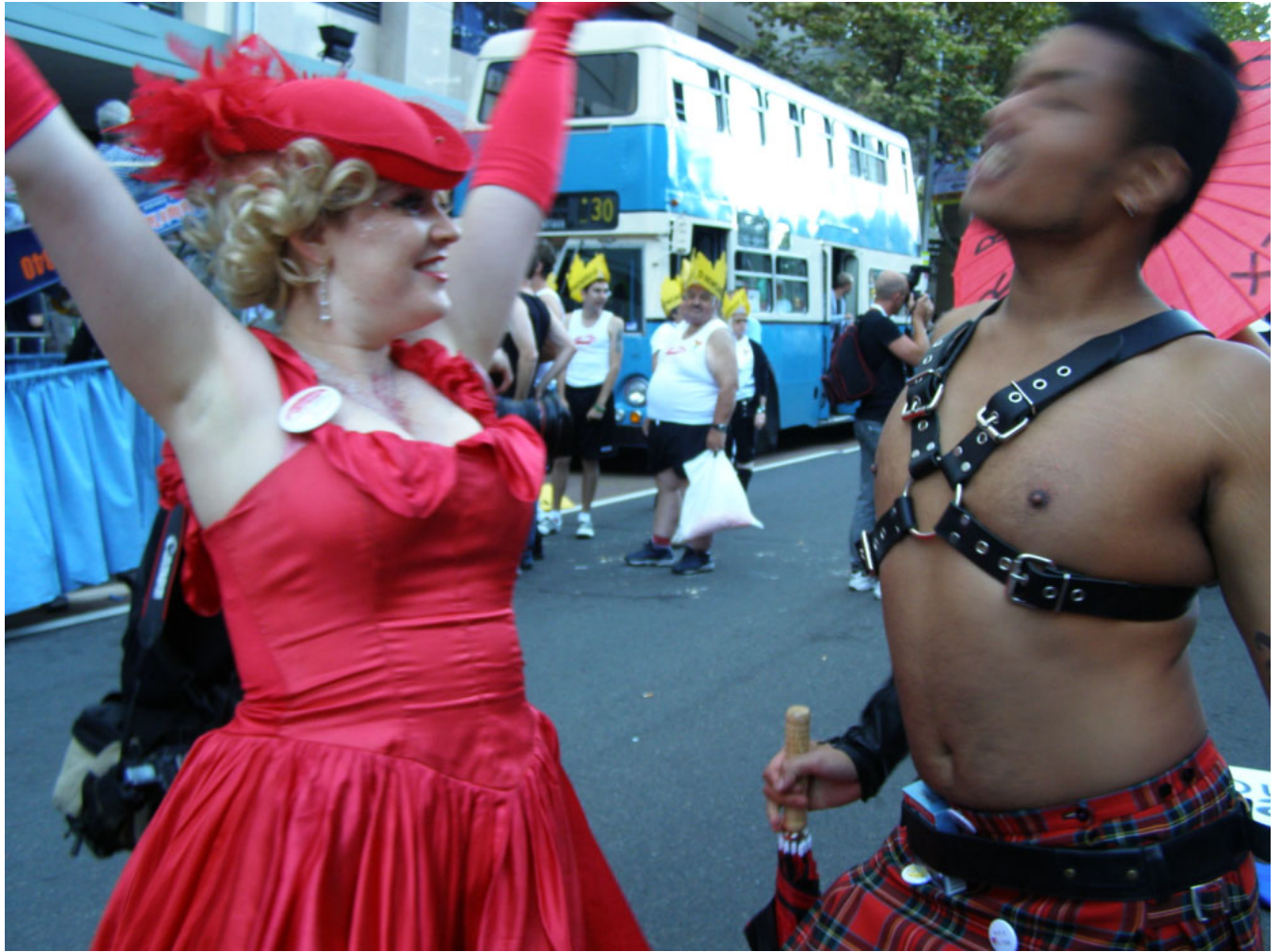
Sex workers at Mardi Gras 2008