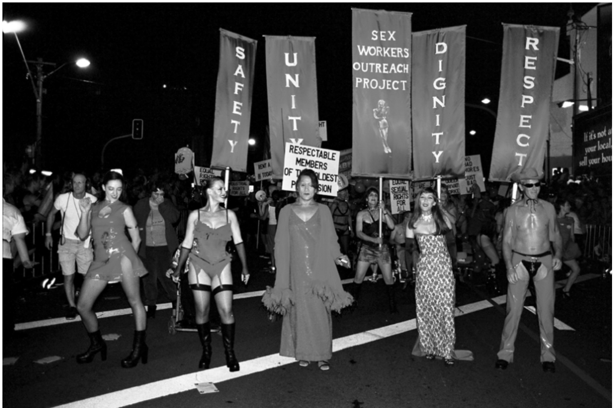
Mardi Gras 2002

The service should be independently reviewed after 18 months, to see how well staffing and services in place match needs in each location. Adjustments should then be made, in keeping with the findings, including restructure and resizing if necessary. After three years establishment time, there should be an independent evaluation against an agreed set of objectives / outcomes to inform strategic planning and funding for the next three year period