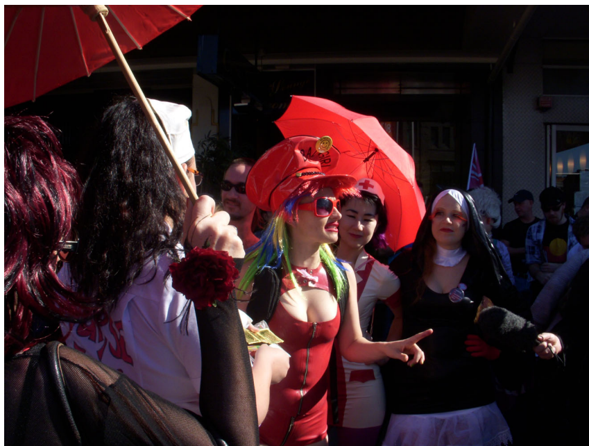
'No To Pope' rally 2008