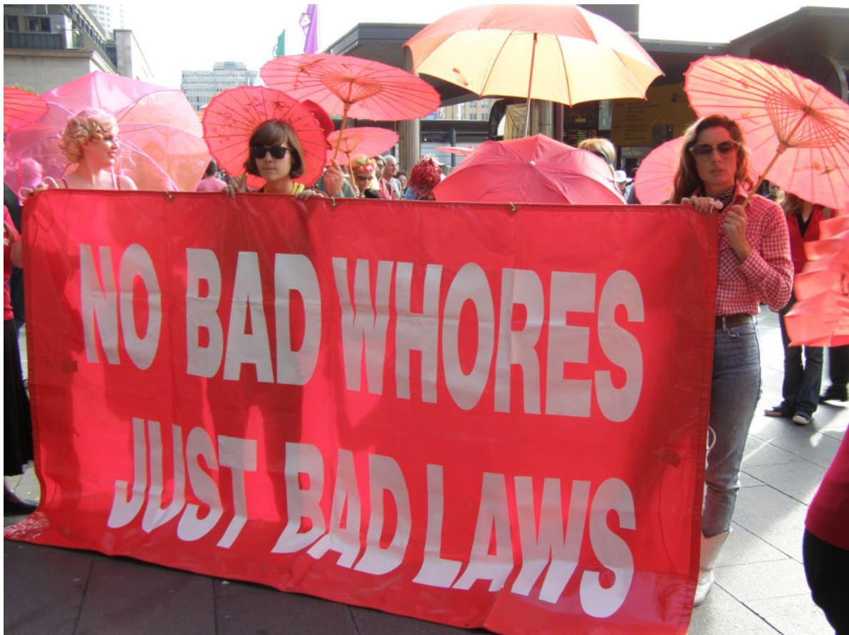
International Whores Day Event 2007