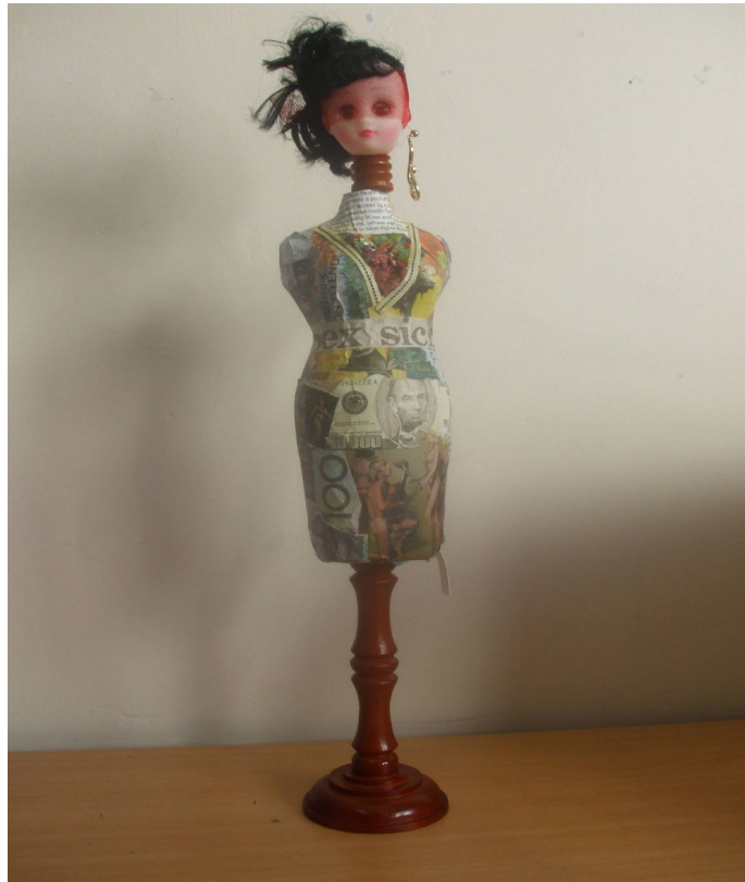
Scarlet Alliance mascot artwork created by Laura B 2008 in Tassie